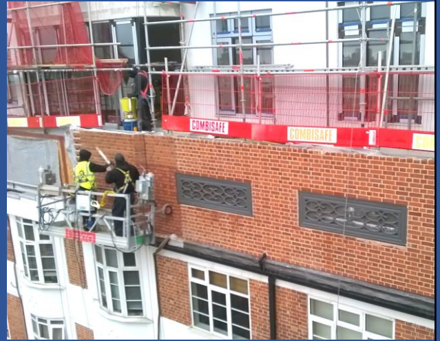
Brick Slip Support and Installation Methods