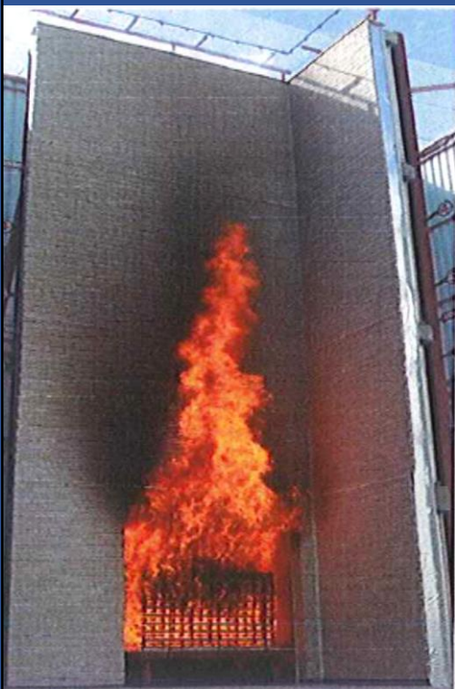
Testing and Regulations